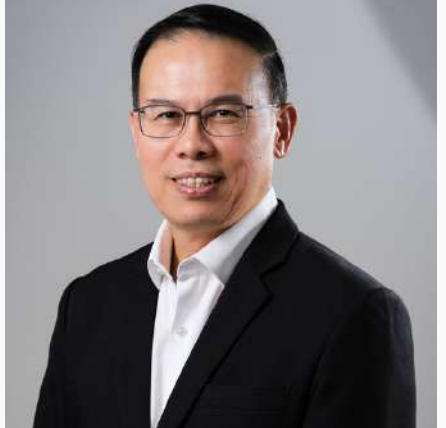
DR. TEO HO PIN Former Mayor & Member of Parliament, Singapore